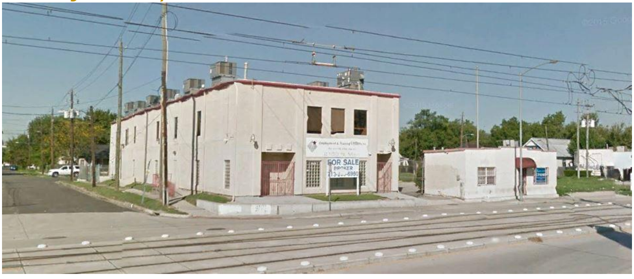
The Building As It Is Envisioned In The Future.